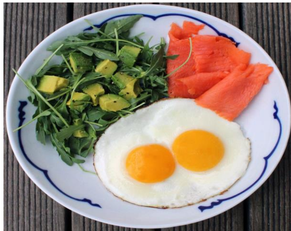
Figure 1 High Protein, low carb breakfast

2) Its Going To Come Down To Portion Control